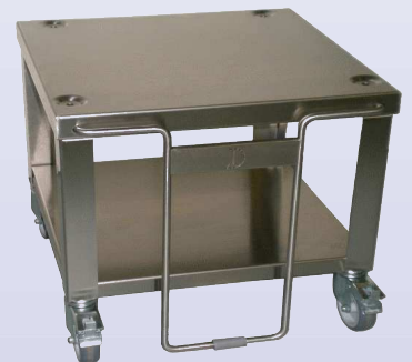
Option – mobile underframe TD 1500